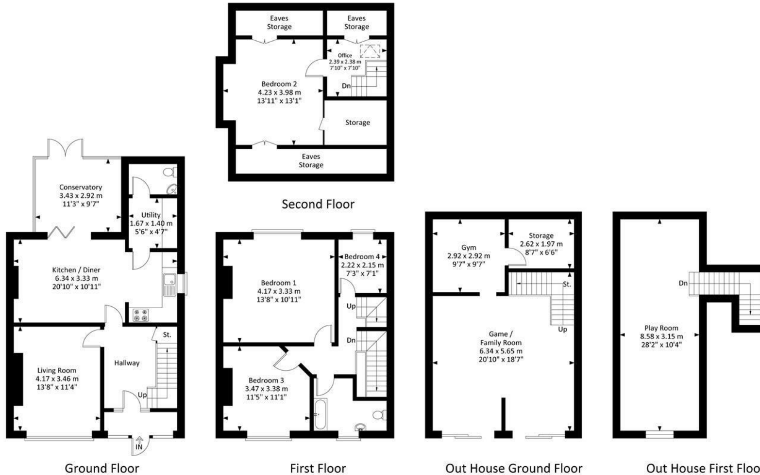
Illustration for identification purposes only, measurements and approximate, not to scale.